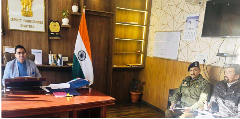
THE KASHMIR TALK BUREAU KISHTWAR: