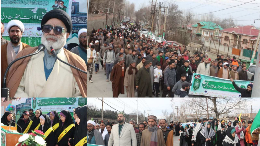
THE KASHMIR TALK BUREAU BUDGAM: