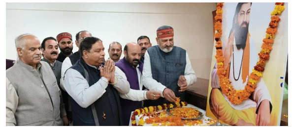
THE KASHMIR TALK BUREAU JAMMU:

J&K BJP celebrated Shree Guru Ravidas Jayanti with fervour at its party headquarters, Trikuta Nagar, Jammu.