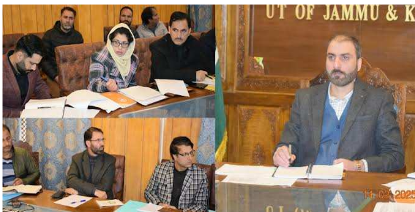
THE KASHMIR TALK BUREAU PULWAMA: