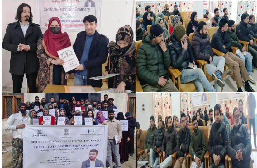
THE KASHMIR TALK BUREAU KUPWARA:

The District Employment & Counselling Centre (DE&CC) Kupwara, in collaboration with Wyath Service Pvt. Limited, successfully organized a Certificate Distribution Ceremony at the Counselling Hall, DE&CC Kupwara today following the completion of a three-month skill training program on GST Assistant with Tally, benefiting 30 trainees who received their certificates.