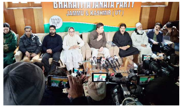
THE KASHMIR TALK BUREAU SRINAGAR:

A crucial meeting of Bharatiya Janata Party (BJP) leaders was held today at Church Lane, Srinagar, to discuss the recently presented Union Budget 2025. The leaders unanimously praised the budget, calling it a progressive and inclusive financial roadmap that will strengthen India's economy, boost employment, and enhance social welfare.