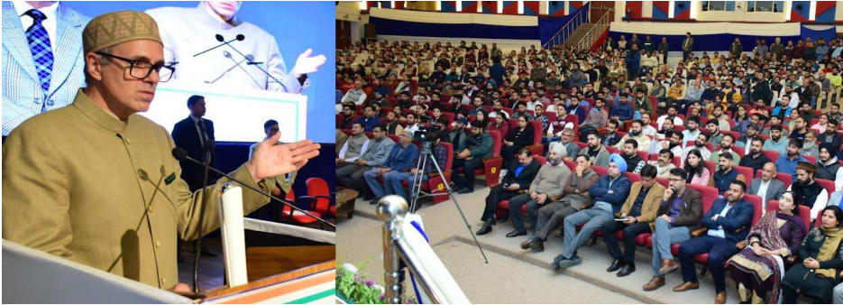
THE KASHMIR TALK BUREAU JAMMU:

Emphasises transparency, commitment in public service