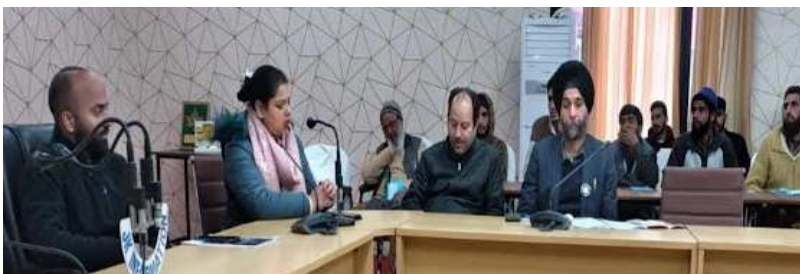
THE KASHMIR TALK BUREAU KISHTWAR:

The two-day District-Level Seminar cum Awareness Programme on Beekeeping concluded today here in the Conference Hall, DC Office Complex.