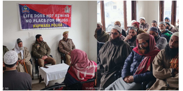
THE KASHMIR TALK BUREAU KUPWARA:

In a continued effort to combat the growing menace of drug abuse, Police Station Sogam, today conducted a Drug Awareness Program in line with the calendar issued by District Police Headquarters, Kupwara.